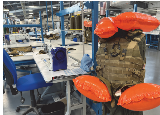
Kennon's Lightweight Emergency Inflatable Life Preserver

Working with HMX-1, Kennon has developed a quickly installable and removable cabin liner system to help support VIP transport. The method utilizes removable, replaceable utility clamps attached to the composite frame stations of the V-22 Osprey. The system's function is to provide appropriate aesthetics for VIP passengers on board. This system is easily configurable for medevac missions and can be developed for the V-280.