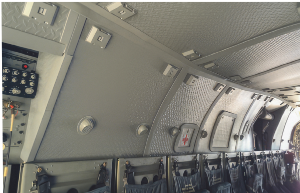
Kennon V-22 Cabin Liner System

Using the UH-60 OEM floor as a baseline, Kennon's non-armored floor has the same thickness and is 8.5% lighter with MIU medical overlay configurability. Kennon's AP-level flooring system (7.62x51 M61 AP) is 55.5% thinner and 34% lighter than the UH-60 OEM floor with MIU and EBAPS overlays. Kennon's non-AP flooring armor system (7.62x51 M80) is 65.4% thinner and 66.3% lighter than the UH-60 OEM floor/MIU/EBAPS combination. Previous testing has shown that Kennon's non-AP flooring system successfully counters 7.62x54R LPS MSC rounds at an areal density of 4.3 psf (based on 80% confidence, 80% reliability criterion). The system has also passed vibration, shock, and static loading test.